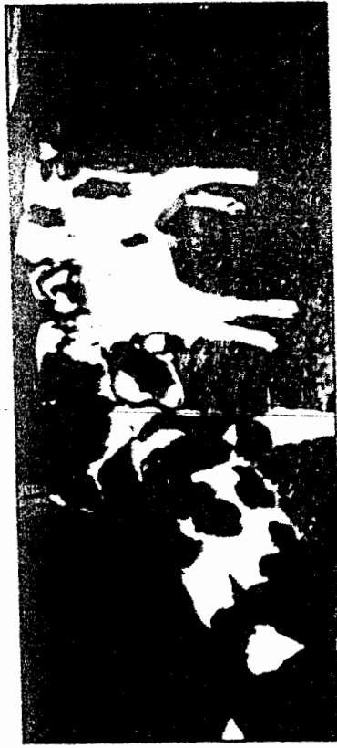
Cattle...this means farmers with fat cattle will do well this December if they market their cattle wisely.

just because there is a big demand for beef in the market. Farmers must make sure that their cattle are sold at the right price all the time. They should get worried when they see their regular customers walking away from deals because this is a sign that the butcher can no longer sell the meat and make a profit at the price the farmers are selling the cattle.